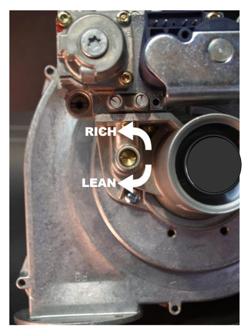
Illustration 2 - Air/Gas Mixture Ratio Screw

Combustion Field Adjustment Instructions