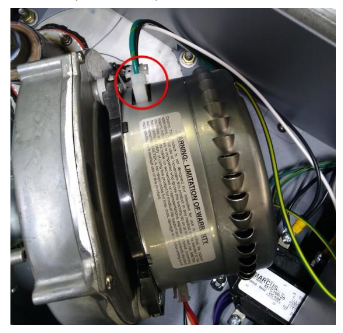
Illustration 4 - Blower Power Supply Wire

3. Cover the inlets of all the disconnected blowers using a plastic cap or tape, in order to ensure that flue gas is not coming out of the other modules' inlets while testing the module currently being adjusted.